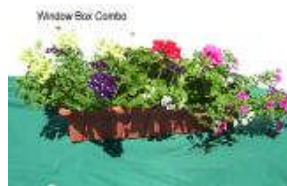
24" (2 ft.) Window Box Planter

The following items are found under the GERANIUMS section on your order form. The 2-gallon geranium is another great choice for Mother's Day. Gorgeous!