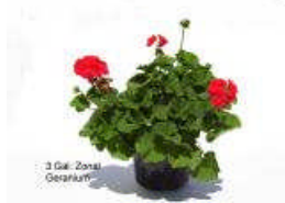
2-gallon Zonal Geraniums