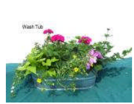
19" Metal Washtub Planter

*Please note – this basket will be FIBER and not white as pictured.