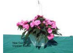
New Guinea Impatiens**