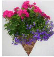
14" Cone Basket