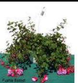
Fuchsia purple & red

**indicates that additional colors are available – please see order form