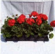
4 1/2" Zonal Geraniums

The following items are found under the GERANIUMS section on your order form. The 2-gallon geranium is another great choice for Mother's Day. Gorgeous!