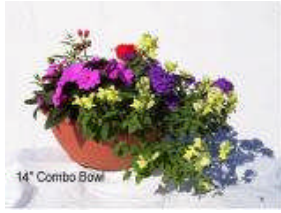
14" Annual Bowl Planter