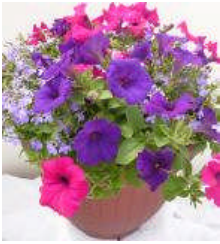
12" Roman Pot

The following items are found under the SPECIALTY PLANTERS section on your order form. These planters are assembled and ready to be placed on your front porch or patio. Don't forget Mother's Day and Teacher gifts!