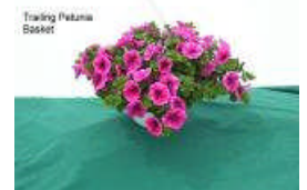
Petunia Trailing Wave**