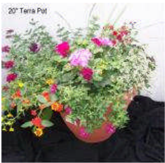
20" Terra Planter

Please note...a photo of the 14" Fiber Hanging Basket – Assorted Annuals is not available. However, it has traditionally been one of our most popular baskets and is absolutely beautiful...the perfect gift for a loved one (or yourself!) We apologize for the inconvenience.