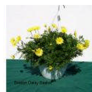
Boston Daisy Yellow

The following items are found under the 10" HANGING BASKETS section on your order form. Not all baskets are pictured. This is another easy way to add color to your landscape...simply pick it up and hang it!