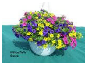
14" Fiber Hanging Basket Million Bells Mixed